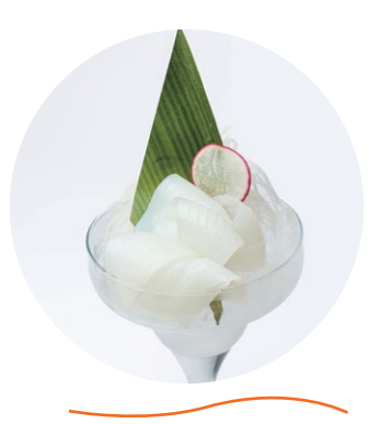
イカ SQUID 6.5