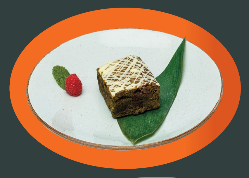
チョコレート抹茶ブラウニー バニラアイス添え Chocolate Matcha Brownie with Vanilla Ice Cream 6.5