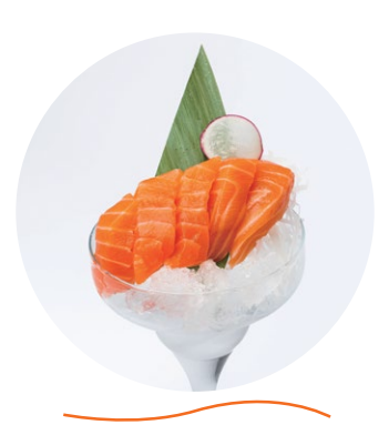
サーモン SALMON 6.5