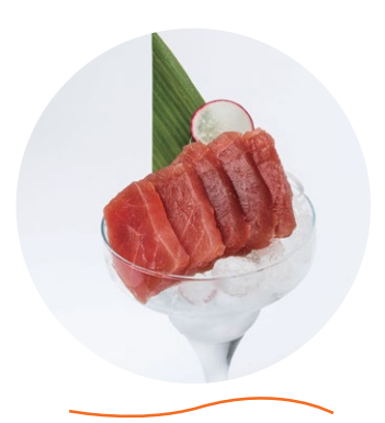
マグロ RED TUNA 7.2