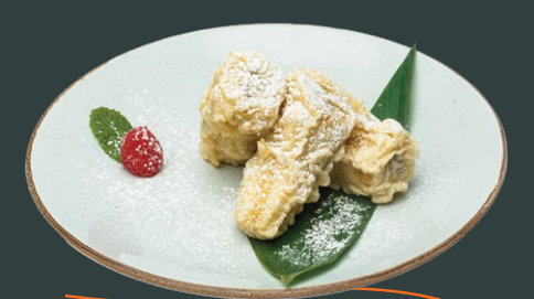
バナナフリッターバニラアイス添え Banana Fritter with Vanilla Ice Cream 6.5