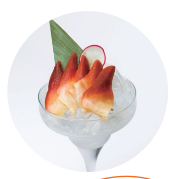
ホッキ貝 SURF CLAM 6.9