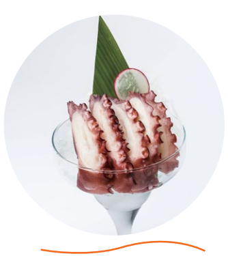
タコ OCTOPUS 6.9