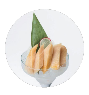
ハマチ HAMACHI 7.2

3 Slices of Red Tuna Sashimi 3 Slices of Salmon Sashimi 3 Slices of Sea Bream Sashimi 17.9