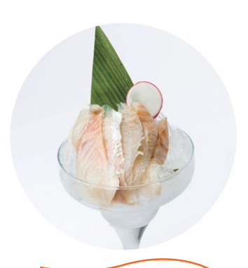
タイ SEA BREAM 6.9