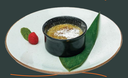
抹茶クリームブリュレ Matcha Crème Brûlée 6.5

Please let a member of staff know if you have any allergies or dietary requirements and they will be happy to assist you.