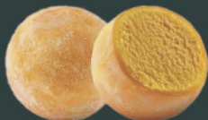
Mango Ice Cream Mochi