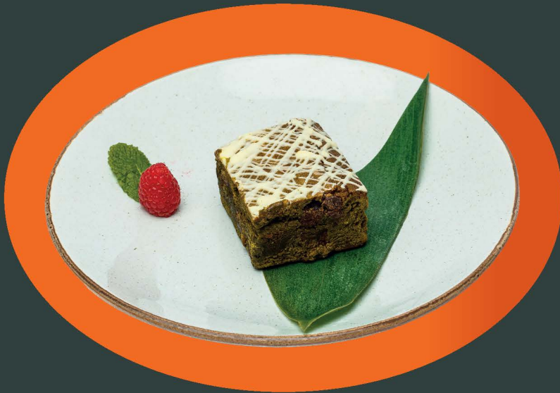
チョコレート抹茶ブラウニー バニラアイス添え Chocolate Matcha Brownie with Vanilla Ice Cream 6.5