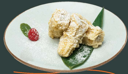
バナナフリッターバニラアイス添え Banana Fritter with Vanilla Ice Cream 6.5