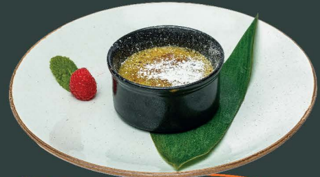
抹茶クリームブリュレ Matcha Crème Brûlée 6.5

Please let a member of staff know if you have any allergies or dietary requirements and they will be happy to assist you.