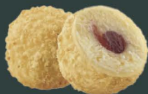
Strawberry Cheesecake Ice Cream Mochi