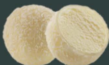
Coconut Ice Cream Mochi