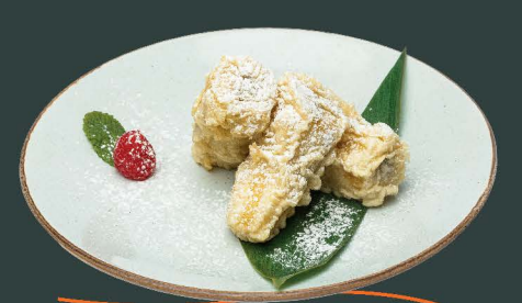
バナナフリッターバニラアイス添え Banana Fritter with Vanilla Ice Cream 6.5