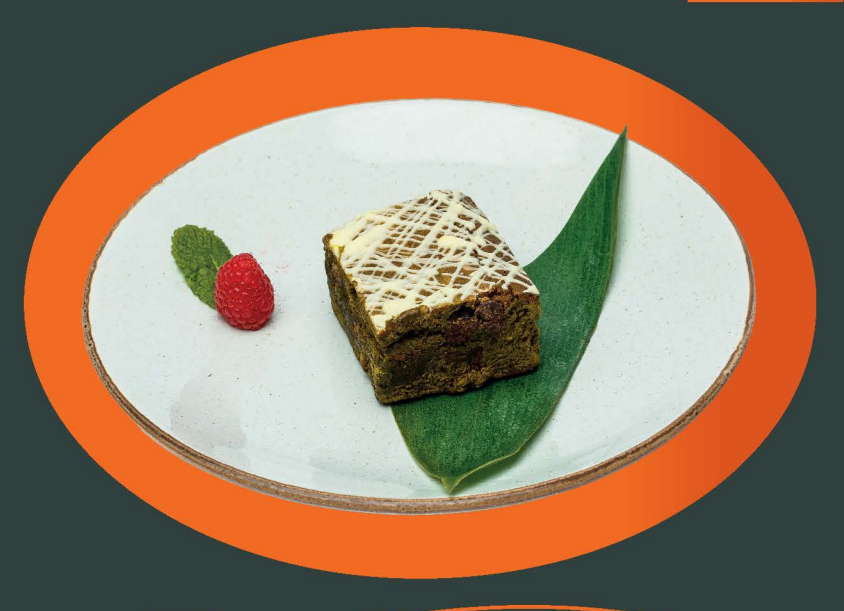
チョコレート抹茶ブラウニー バニラアイス添え Chocolate Matcha Brownie with Vanilla Ice Cream 6.5