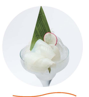
イカ SQUID 7.4