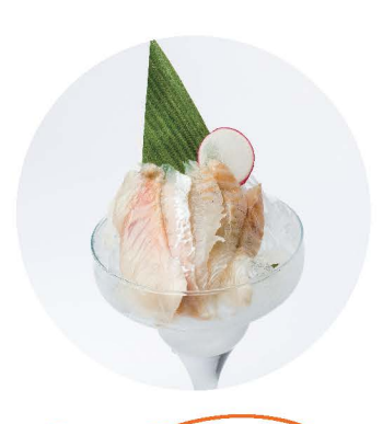
タイ SEA BREAM 7