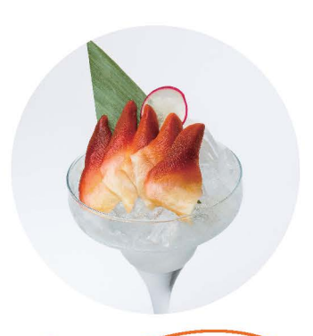
ホッキ貝 SURF CLAM 7.4