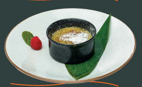
抹茶クリームブリュレ Matcha Crème Brûlée

Please let a member of staff know if you have any allergies or dietary requirements and they will be happy to assist you.