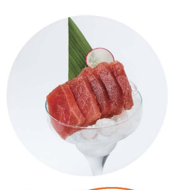
マグロ RED TUNA 8