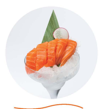
サーモン SALMON 7.4

3 Slices of Red Tuna Sashimi 3 Slices of Salmon Sashimi 3 Slices of Sea Bream Sashimi 13.4