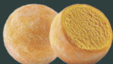
Mango Ice Cream Mochi