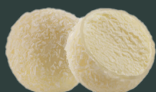
Coconut Ice Cream Mochi