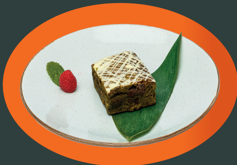
チョコレート抹茶ブラウニー バニラアイス添え Chocolate Matcha Brownie with Vanilla Ice Cream 6.5