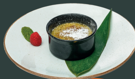
抹茶クリームブリュレ Matcha Crème Brûlée 6.5

Please let a member of staff know if you have any allergies or dietary requirements and they will be happy to assist you.