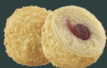
Strawberry Cheesecake Ice Cream Mochi