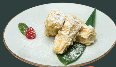
バナナフリッターバニラアイス添え Banana Fritter with Vanilla Ice Cream 6.5